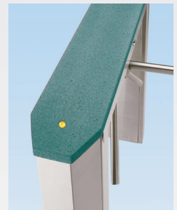
PTZ Trapezoid-end with Corian®/wood*