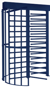
Also available in hot-dipped galvanized or powder coat finishes.