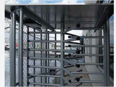
Shown (below) HS430-S powder coated turnstile with optional ADA Mesh Gate and custom size Filler Barrier (made to your job's requirements)

Optional full canopy available in stainless steel.