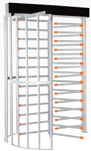
Optional black or safety orange end caps available.