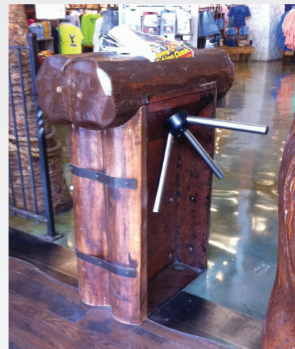
BR5500-S (customized by customer)