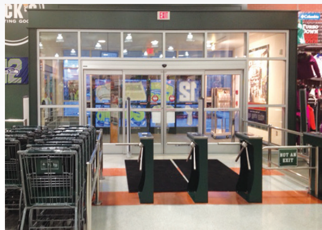
BR5500-S (tripod style arm) with custom BR5500-ADA Swing Gate