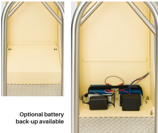
Optional battery back-up available

* Dimensions are subject to change without notice