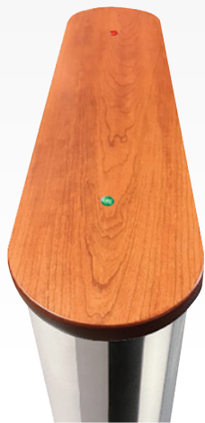
Optional wood top upgrade shown with lights