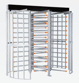
Optional black or safety orange end caps available.

304 Stainless, No. 4 Satin finish (shown)