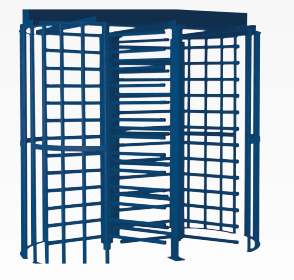
Hot-dipped galvanized finish. Also available in stainless steel or power coated finishes.