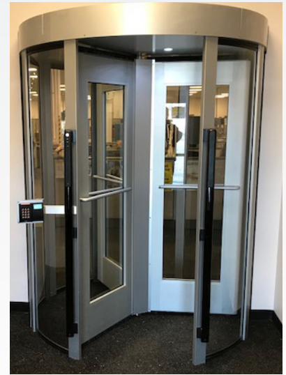
RD70 shown with optical anti-tailgating (entry side)

The Monitor™ RD70 Series is a stylish 3-vane high security portal. It is designed for locations requiring improved visitor security or as the barrier between production and office areas. Instead of a traditional physical barrier to prevent passage in the wrong direction, the RD70 comes equipped with a high tech ultrasonic sensor. This sensor allows for a full door panel appearance while still enforcing standard turnstile passage flow.