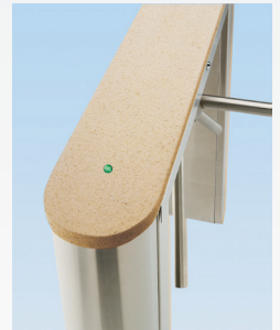
PTR Round-end with Corian®/wood*