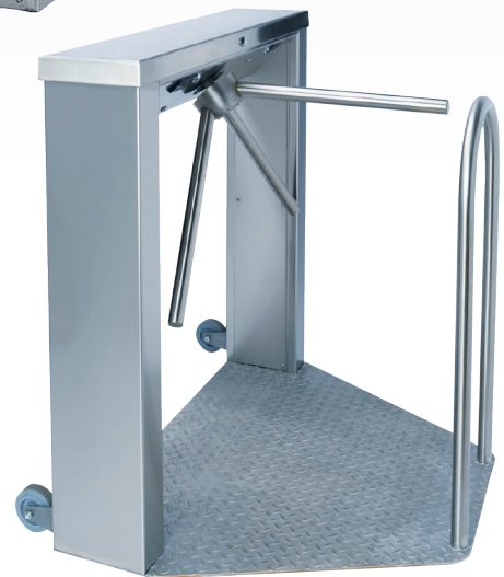
PTS-P with custom angled base plate