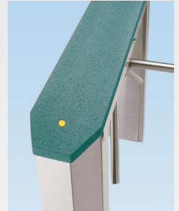
PTZ Trapezoid-end with Corian®/wood*