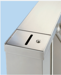
Optional ticket box

The PassThru™ Series is ideal in demanding situations where you want a more open, stylish look. It is made for years of reliable service in high traffic/volume applications. The cabinets are constructed of heavy 14-gauge, 300 series satin stainless steel and features our 6500 Series Control Head (with auto indexing and shock suppression technology). This unit features our longest turnstile arm.