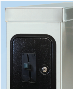
Optional coin box