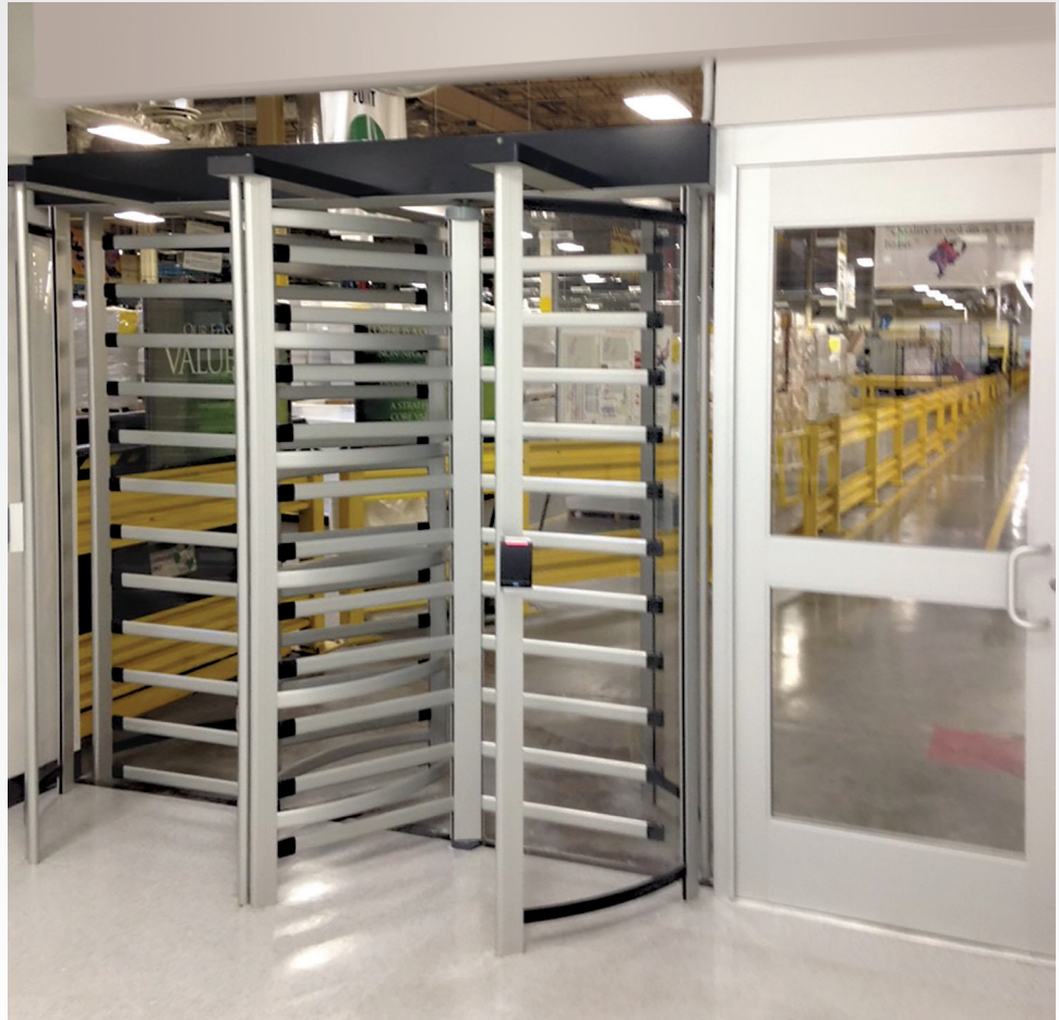
Sample Application: T80-T and T36-ADA door

The T36-ADA is a solution for projects requiring an aesthetically pleasing interior security door. This self-closing unit provides wheelchair accessible 36" passage width (overall width 40"). It is a "heavy-duty" stile and rail door that can withstand high traffic and abuse. Its low voltage strike lock can be used mechanically or electronically depending on your needs. The T36-ADA is normally paired with the T80-Single, T80-Tandem, P60 or RD70 aluminum-polycarbonate turnstile portals.