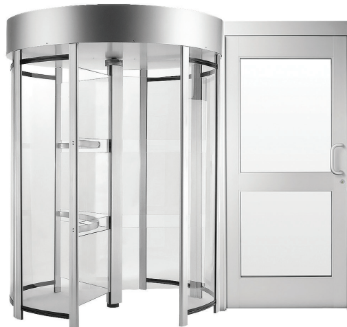
P60 and T36-ADA door