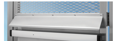
Optional Push Bar available for free exit configurations. Can be ordered with a battery alarm or electronic switch if needed