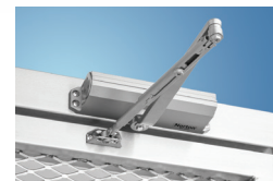
Hydraulic door closer included

For more than 30 years, Controlled Access has been the globally trusted name in pedestrian control equipment. Made in Ohio and shipped worldwide, we are the first choice of leading architects, facility managers, security consultants, and engineers. Whether your project requires high security full-height turnstiles, waist high units, or matching ADA accessible gates, Controlled Access is the secure choice. We're experienced in access control systems, from card readers to biometric scanning, to give you the power to control access.