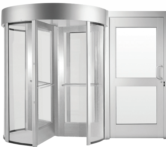
RD70 and T36-ADA door

American Welding Society (AWS) Standard D 1.1