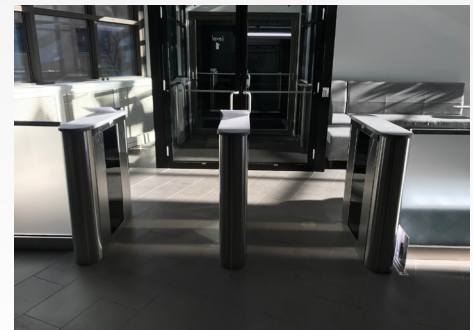
(BE800-R with Primary, Hybrid & Secondary Cabinet)