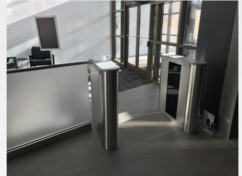
(BE800-R with Primary & Secondary Cabinet)

For more than 30 years, Controlled Access has been the globally trusted name in pedestrian control equipment. Made in Ohio and shipped worldwide, we are the first choice of leading architects, facility managers, security consultants, and engineers. Whether your project requires high security full-height turnstiles, waist high units, or matching ADA accessible gates, Controlled Access is the secure choice. We're experienced in access control systems, from card readers to biometric scanning, to give you the power to control access.