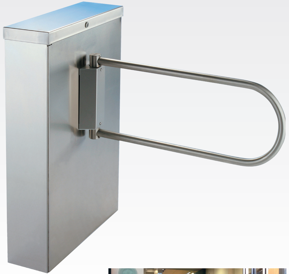
FP500-ADA (gate can be motorized)

This product is the ADA compliant sister unit to our FP500 tripod turnstile.