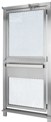
HS336 - Back (stainless steel with optional mesh push bar)

* Dimensions are subject to change without notice